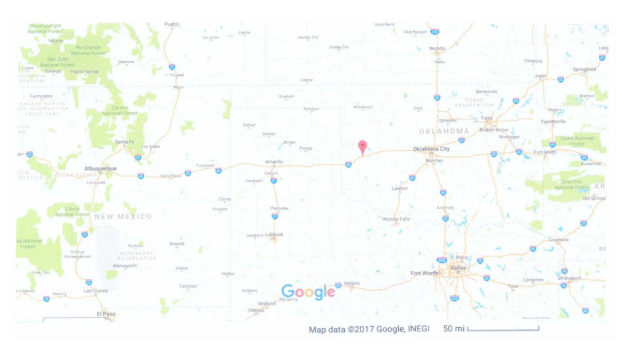
The City of Elk City is located on Interstate 40 in far Western Oklahoma in Beckham County as shown on the map above. We are halfway between Oklahoma City, Oklahoma and Amarillo, Texas.